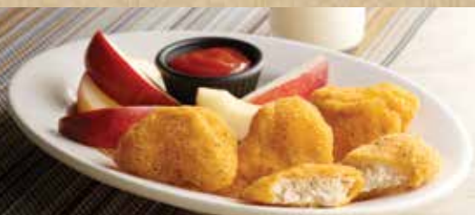
*20 Best Kids-Menu Dishes (J.D. Nuggetz), #1 Family Restaurant, Top 10 Family Restaurants - Parents magazine