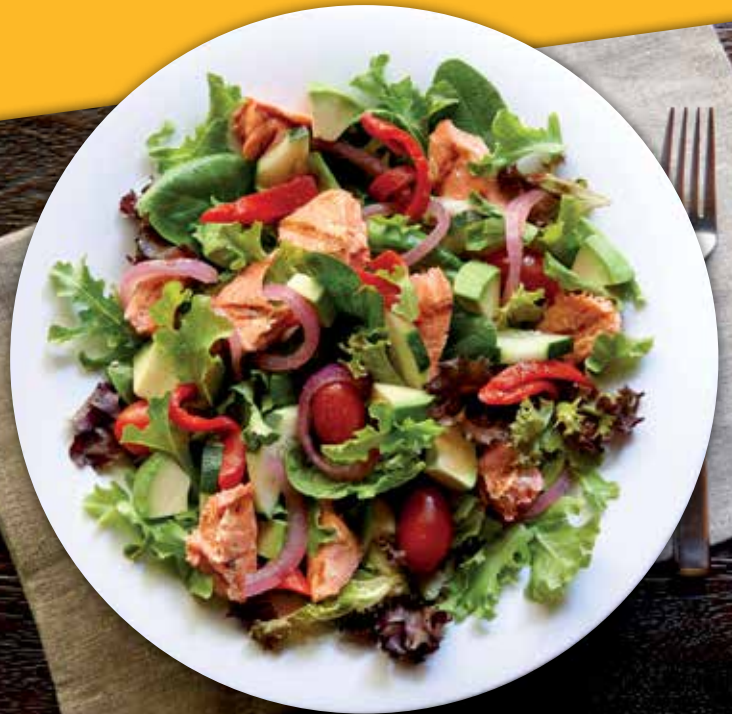
NEW! SALMON PACIFICA SALAD

Our foods are free from dyes, artificial trans fats and flavors, processed MSG, and high-fructose corn syrup.