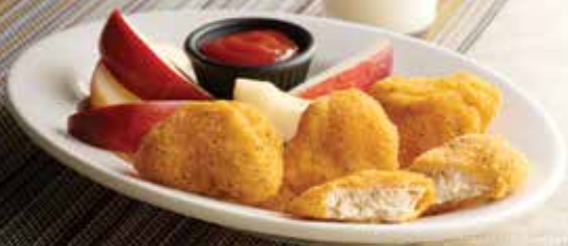
*20 Best Kids-Menu Dishes (J.D. Nuggetz), #1 Family Restaurant, Top 10 Family Restaurants - Parents magazine